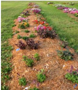
"Instant Bed"/No-Dig Garden

Hi everyone. The weather certainly is feeling more like spring a lot of the time. I am getting more urge to get out and get busy in the garden but wait.....it's still too early for tender frost sensitive plants like tomatoes and peppers. As we discussed last month this is the right time for cool weather crops like lettuce, spinach, peas, various greens like kale, chard and others. We did get snow peas, lettuce, kale and Swiss chard planted on